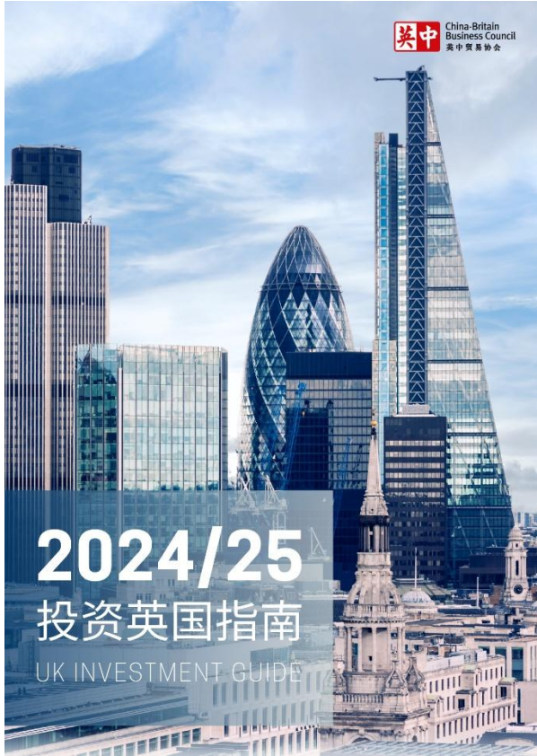
PUBLISHED IN SEPTEMBER 2024