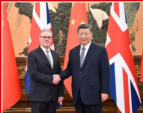
29 th January 2026, Beijing

The UK's Prime Minister, Kier Starmer, visited China in January 2026, demonstrating the bilateral opportunities for UK-China investment and trade.