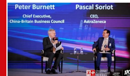
2026 UK-China Business Forum, Shanghai