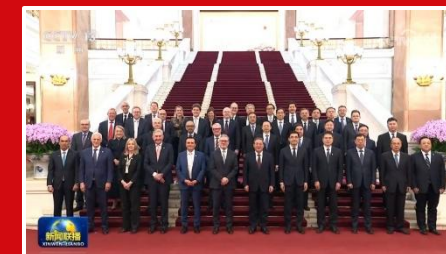
2026 UK-China Business Council, Beijing

Throughout and beyond 2026, we will build upon the momentum of the Prime Minister's visit to China and support the roles our members play in deepening the UK-China investment and trade relationship. The UK Investment Conference in 2026 will be a central part of this programme, alongside a range of conferences, dialogues, roundtables and delegations.