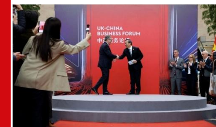
2026 UK-China Business Forum, Beijing