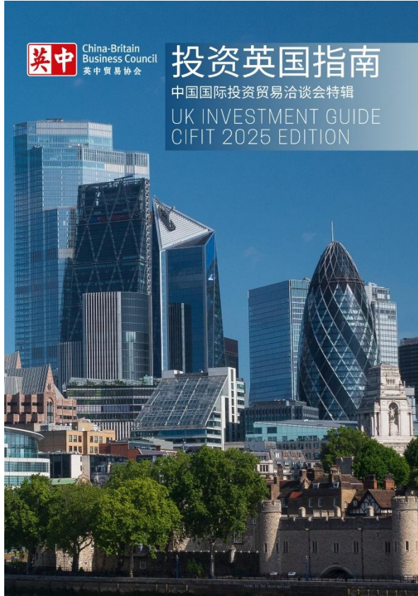
PUBLISHED IN SEPTEMBER 2025

We have worked with a wide selection of members and partners for previous iterations of our UK Business Guide, including: