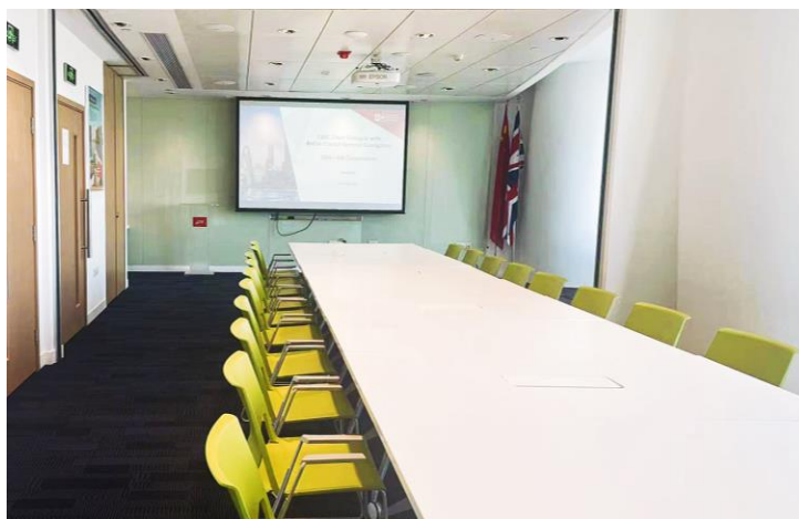
Combined Perth & Cardiff