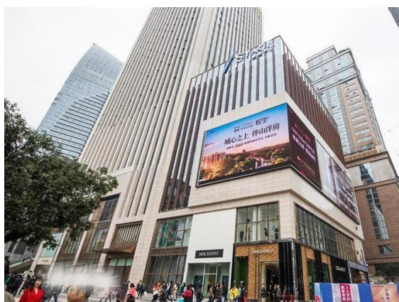
STAGE Shopping Centre

For the Great British Brands Festival Chongqing, we have invited British designers to design the venue, which will be themed as a British garden. The area will be characterised and animated by full-height, bold images of British flowers and gardens, as well as 3D ornaments. STAGE offers a broad-reaching platform on which to introduce your Great British products to local consumers and to strengthen your brand image in West China.